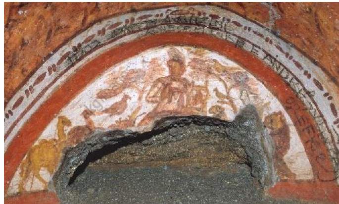
Image 5. Orpheus, Domitilla catacomb, Rome, around 360 AD.