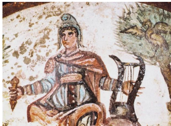
Image 4. Orpheus, St. Peter and Marcellinus catacombs, Rome, early 4 th century