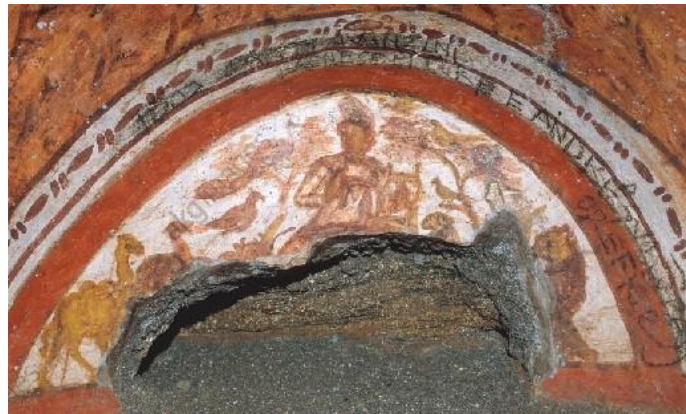
Image 5. Orpheus, Domitilla catacomb, Rome, around 360 AD.