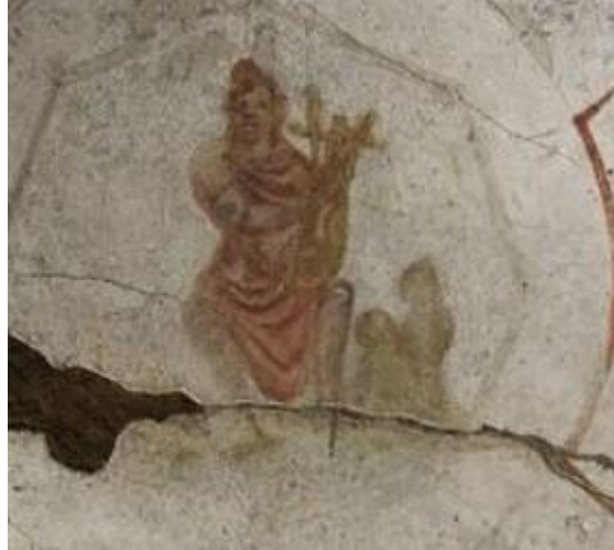
Image 3. Orpheus, St. Callixtus catacomb, Rome, early 3 rd century