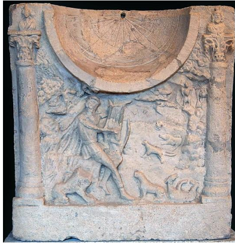
Image 6. Sundial with the image of Orpheus from Silistra, Bulgaria (Durostorum), 2 nd -3 rd century

Depictions of Orpheus did not appear in his homeland Thrace until the Greco-Roman syncretism of the 1 st –3 rd century, when the southern Danubian lands became Roman provinces. The most famous depiction from this period is from a sundial, dated 2 nd –3 rd century – an artifact without parallel in the Roman Empire.