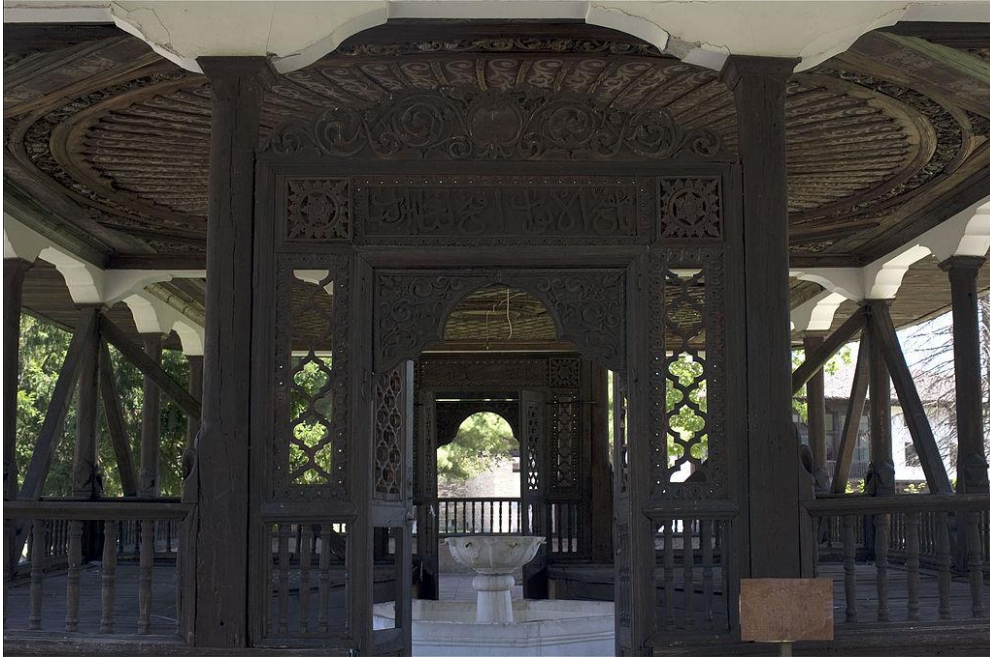
Image 2. Dervish Arabat Baba Teke, Tetovo, Macedonia. https://commons.wikimedia.org/wiki/File:Arabati_Baba_Teke,_Tetovo.jpg