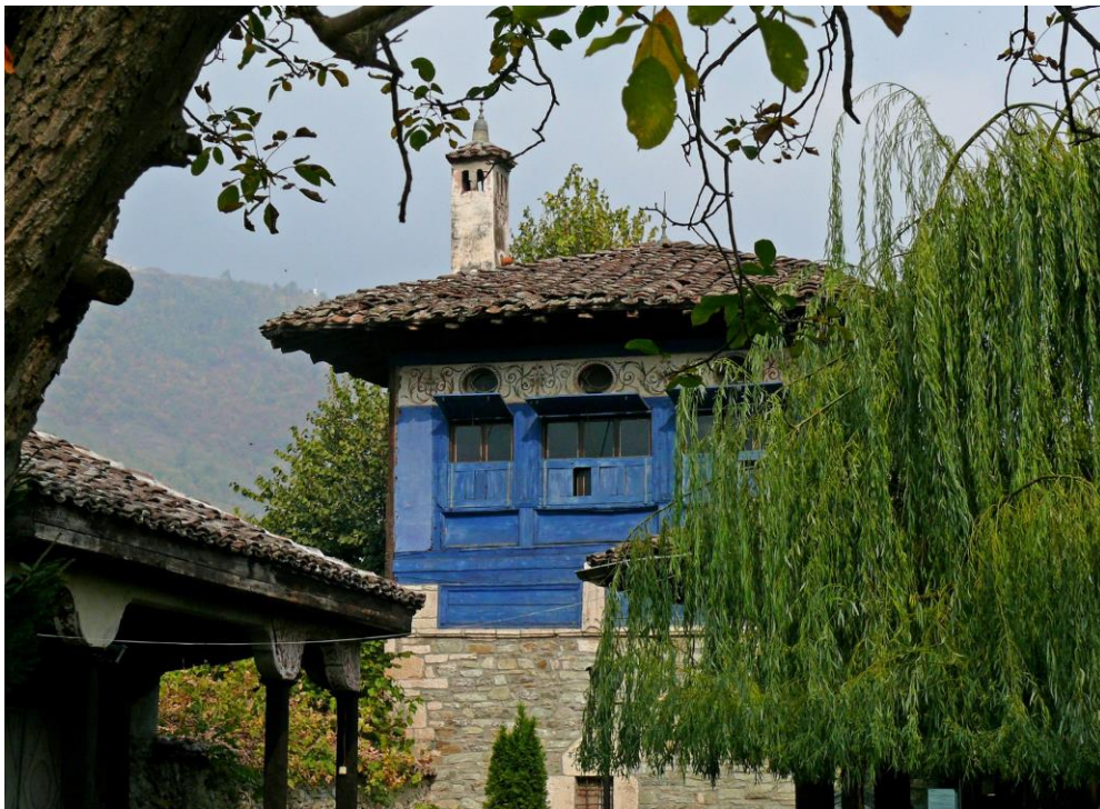
Image 1. Arabati Baba Teke, Tetovo, Macedonia.

https://commons.wikimedia.org/wiki/File:Arabati_Baba_Teke,_Tetovo.jpg